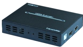
HDMI 转 HDBaseT TX 发射器 × 1