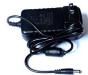
DC12V/3A 电源 × 1