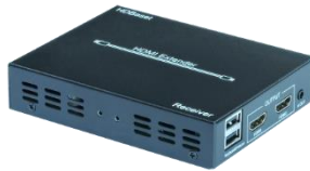
HDBaseT to HDMI Receiver RX x 1pcs