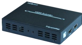
HDMI to HDBaseT Sender TX x 1pcs