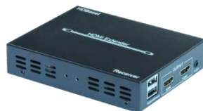
HDBaseT 转 HDMI RX 接收器 × 1