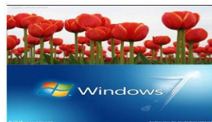
Top-down of POP