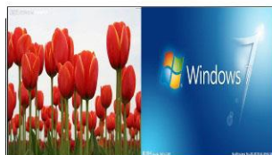
Left-right of POP