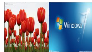
Left-right of POP