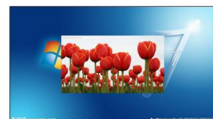
Center of PIP