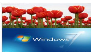
Top-down of POP