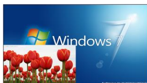
Left-down of PIP