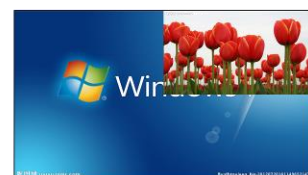
Right-up of PIP