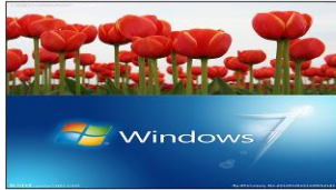
Top-down of POP