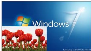
Left-down of PIP