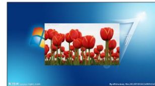
Center of PIP