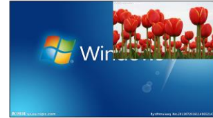
Right-up of PIP