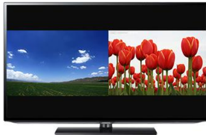
Non deformable mode