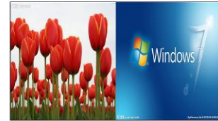
Left-right of POP