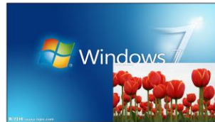
Right-down of PIP